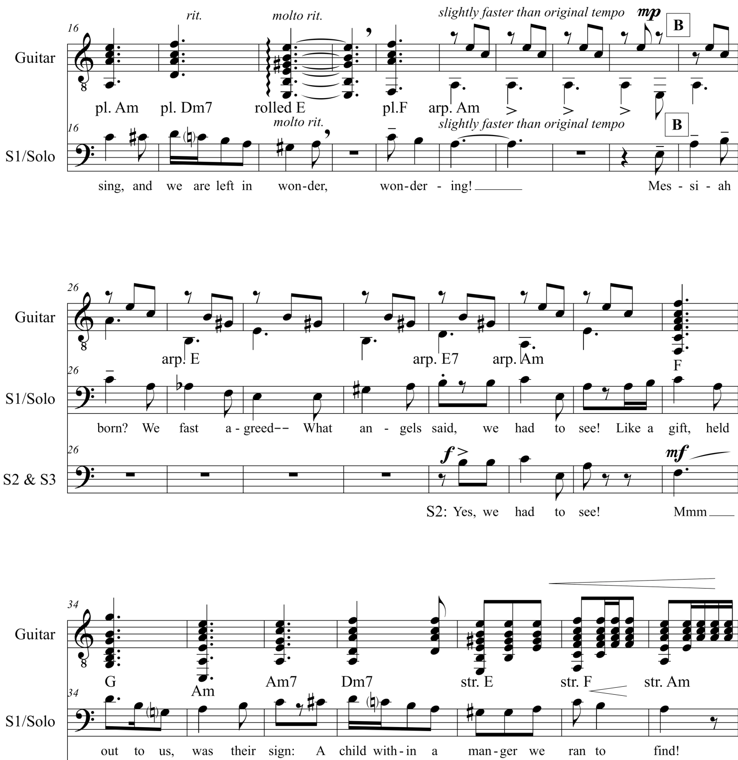
The Shepherds Recollect